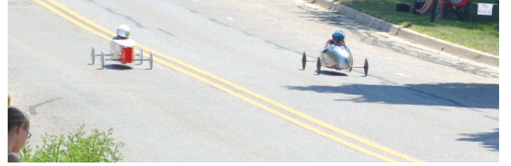
These two youngsters speed down the Park Street hill in their respective soapbox race cars towards the finish line.