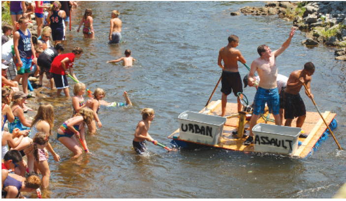
Competitors make their way down the Boyne River during the Commemorative raft race. Spectators and competitors alike toss water balloons and shoot squirt guns at each other during the event.