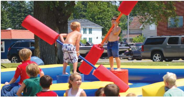
The Boyne City 4th of July festivities included bounce houses, water slides and jousting for kids of all ages.