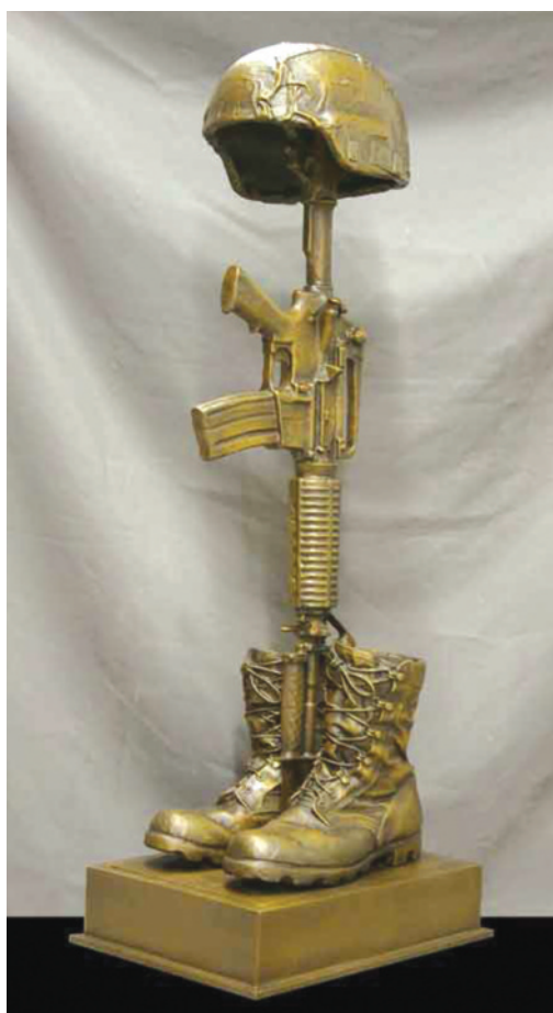
This bronze statue, known as "The fallen Soldier" was carefully selected by the Boyne City war Memorial Committee and will be placed at the Veteran's memorial site on July 20.