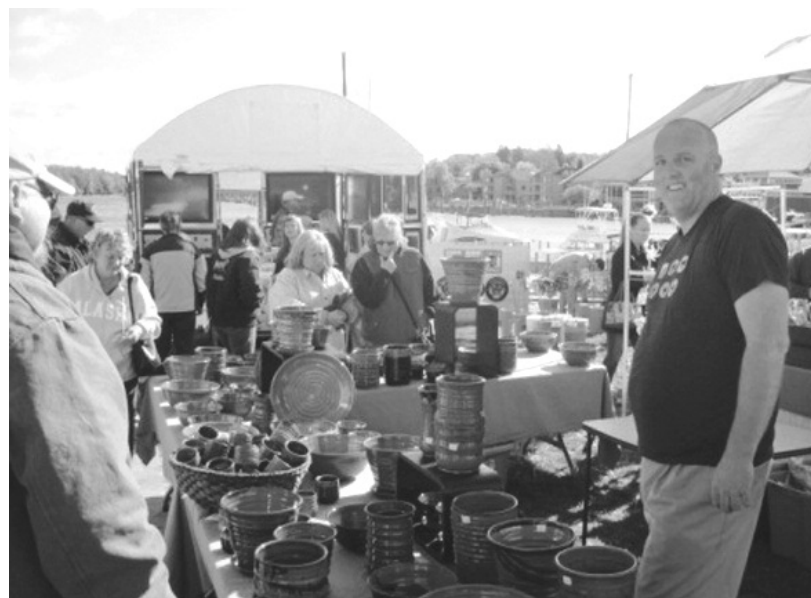
CharArtShow2012Photo; This weekend's 44th Annual Charlevoix Art & Craft Show is a spectacular representation of craftsmanship and artwork with many fun and unique products to choose from.

If you are looking for a unique shopping opportunity in a one of a kind community, Charlevoix the Beautiful is the place to be this coming weekend. Show hours are Saturday 10:00am to 6:00pm and Sunday 10:00am to 4:00pm.