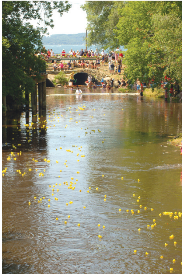
The Boyne Chamber's 23rd Annual Duck Race in the Boyne River make their way to the finish line.