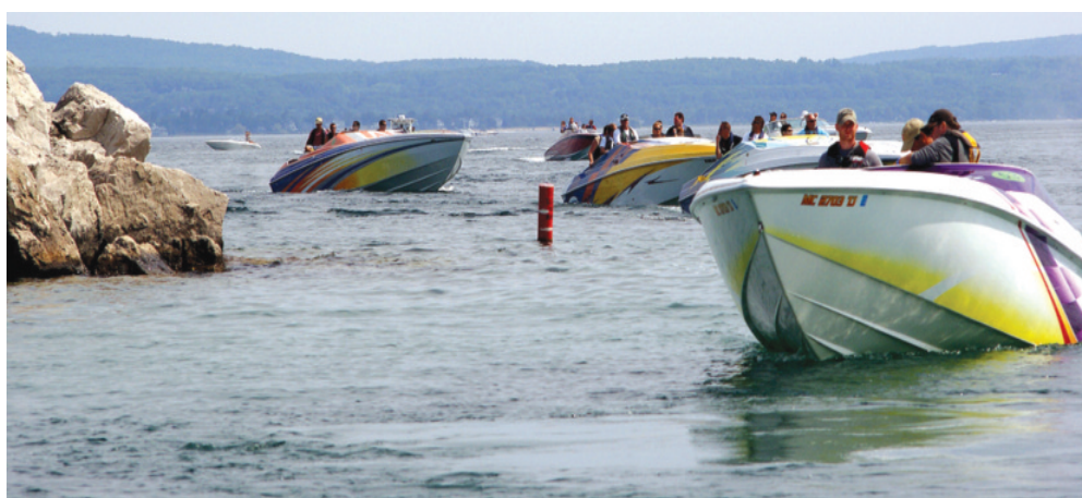
Over 60 high performance thunder boats will roar through Lakes Charlevoix and Michigan at the ninth annual Boyne Thunder Poker Run this weekend.

Annual race has raised more than $220,000 for Camp Quality