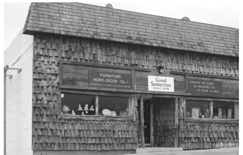
The approximately 1,800 square foot Good Samaritan Furniture & More showroom at 6517 Center Street in Ellsworth is full of gently used sofas, chairs, tables, dressers, beds, lamps, pictures, household nick-knacks...just about anything imaginable to furnish or decorate the home.

The Good Samaritan Furniture & More Showroom is located on Center Street in Ellsworth diagonally across from the Front Porch Café. The shop is open from 10 am to 4 pm Tuesday through Friday, and from 10 am until 2 pm on Saturday. For further information, call the showroom at (231) 676-3339 or visit www.thegood-sam.org .